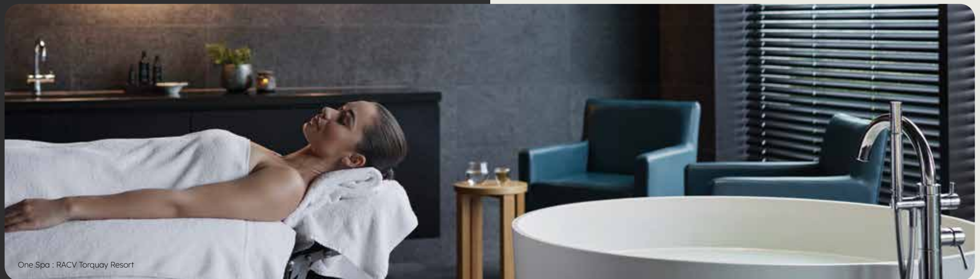
One Spa : RACV Torquay Resort

Skin is revitalised with a full body Akwaterra exfoliation before a deeply nourishing body hydration. Tension is then eased with a scalp, neck and shoulder massage.