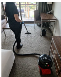
Vacuuming a room