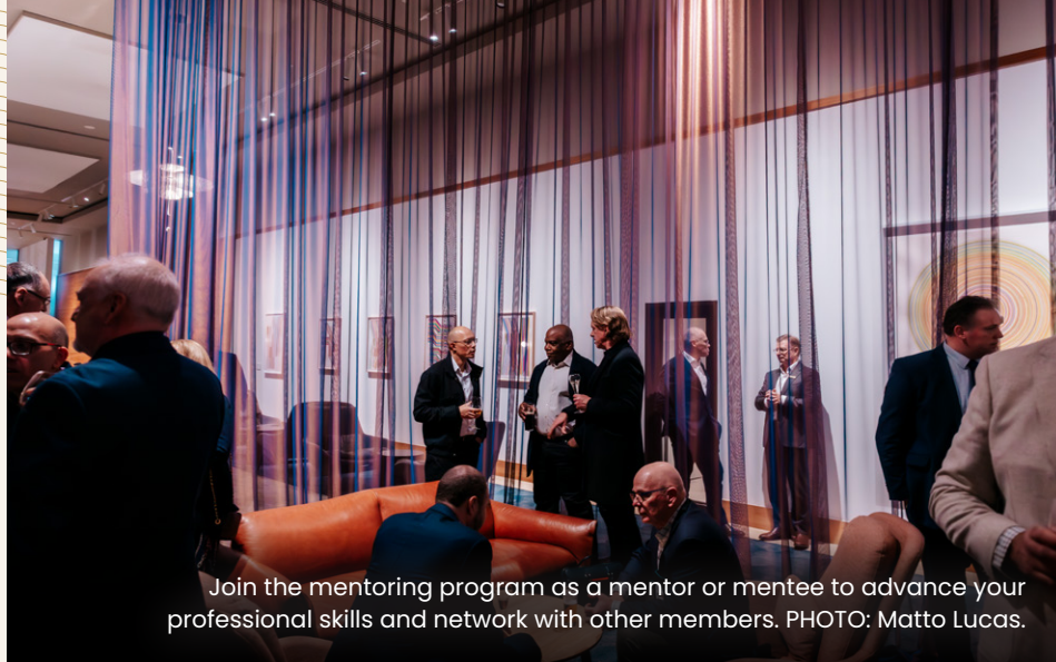
Join the mentoring program as a mentor or mentee to advance your professional skills and network with other members.