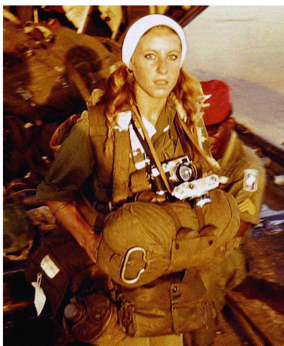
Catherine Leroy, Jump, 1967