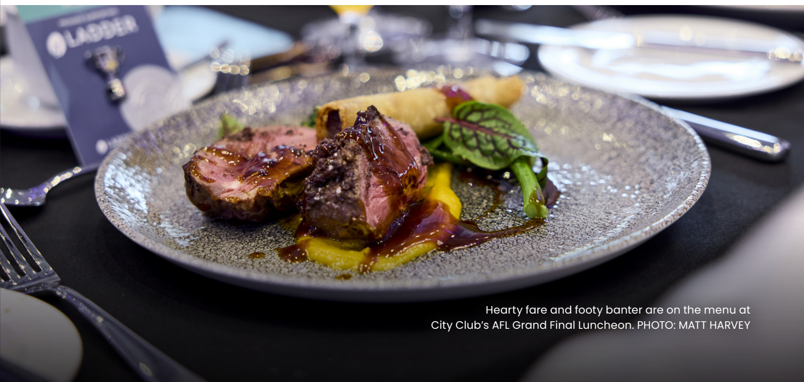
Hearty fare and footy banter are on the menu at City Club's AFL Grand Final Luncheon.

I look forward to welcoming members at our many and varied Club events and activities in August.