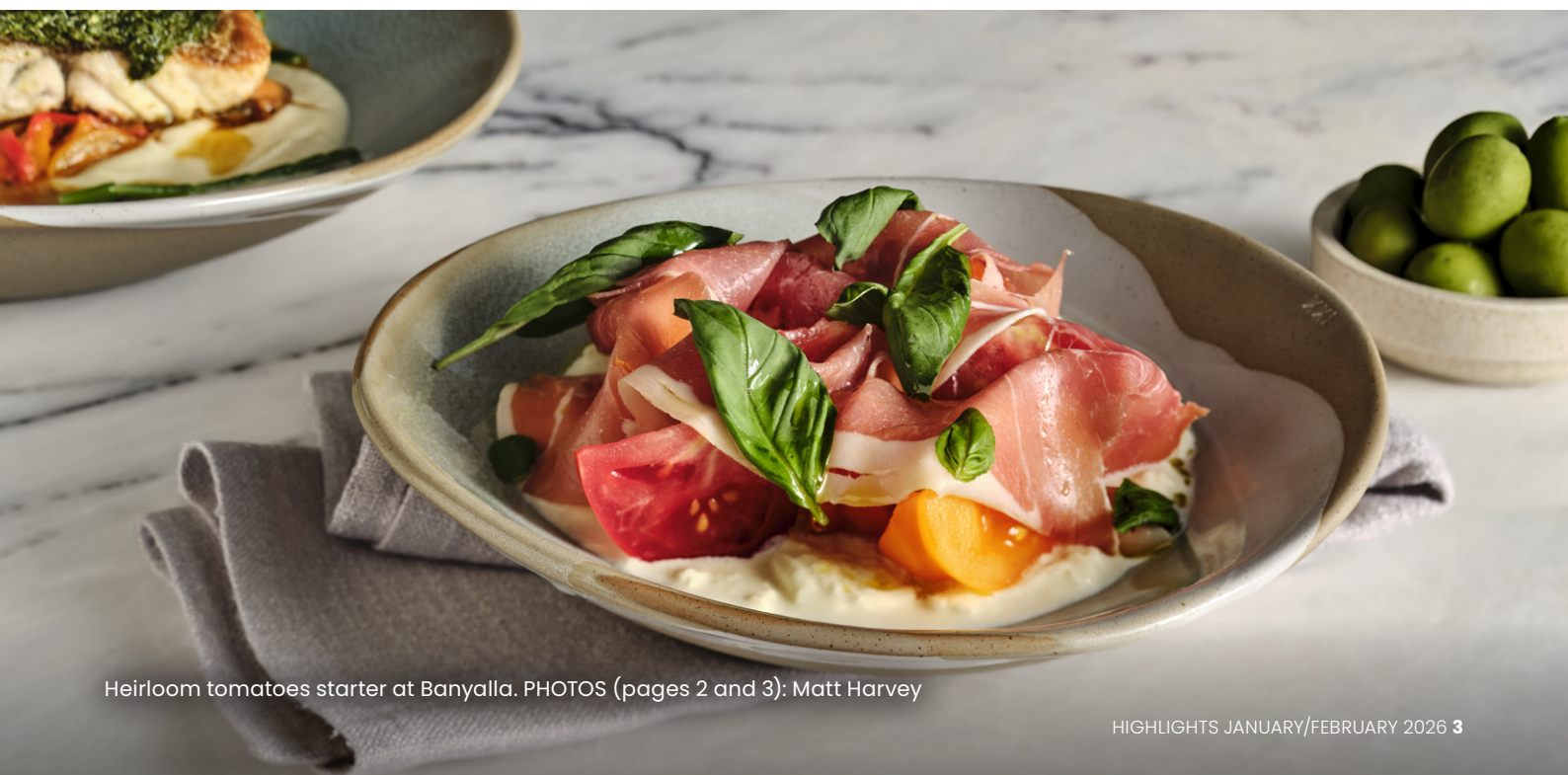
Heirloom tomatoes starter at Banyalla.

Looking ahead to our next edition, the 2026 AFL season kicks off with a flourish. Our corporate suites, capturing the best of the on-ground action, are already filling up fast. We also invite you to indulge in our Easter feasters, including the annual Easter Sunday luncheon and artisan hot cross buns to cross the Yarra for at Le Petit Gâteau.