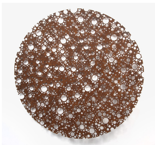
Lindy Lee, Veil of Transience , 2025 fire, steel, 148cm diameter, Courtesy the artist and Sullivan + Strumpf.

This year, RACV adds its own flair to the festivities. Join us for a spirited tour of the Art Fair, ending in the VIP Lounge with a well-earned glass of wine and canapés. Tickets are $40 per person; available online. For those unable to join the tour, RACV members can still step inside the Art Fair with an exclusive 2-for-1 ticket offer. Enter the promo code RACV online to unlock discounted entry. *T&Cs apply.