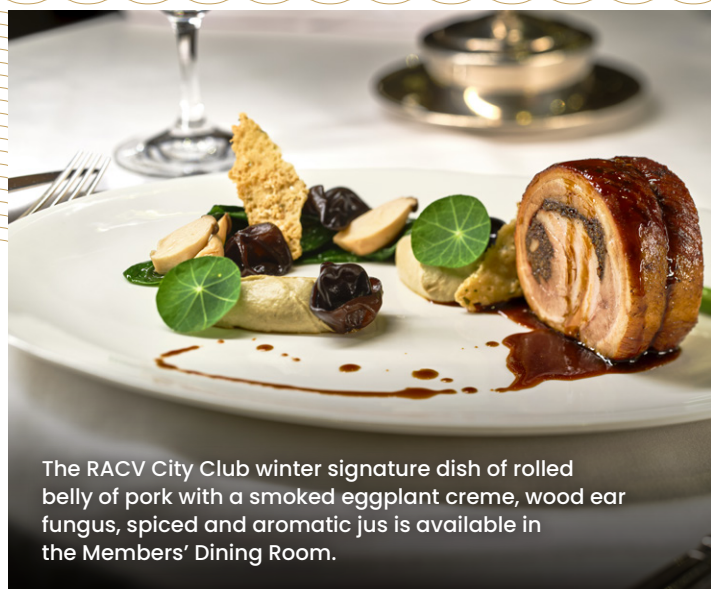
The RACV City Club winter signature dish of rolled belly of pork with a smoked eggplant creme, wood ear fungus, spiced and aromatic jus is available in the Members’ Dining Room.

WORDS: NICOLE BITTAR