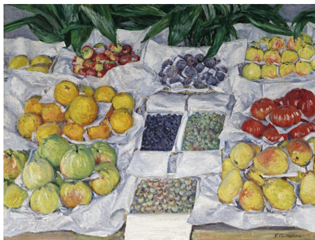
Gustave Caillebotte, Fruit displayed on a stand c. 1881–82, oil on canvas, 76.5 x 100.6 cm, Museum of Fine Arts, Boston, Fanny P. Mason Fund in memory of Alice Thevin (1979.196)

WORDS: NICOLE BITTAR