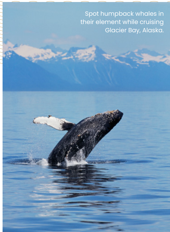
Spot humpback whales in their element while cruising Glacier Bay, Alaska.

Juneau, Alaska's capital city, is a magnificent introduction to the most northerly state of the US. Known as the most picturesque capital city in the country, Juneau is sandwiched between snowcapped