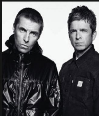
Oasis Live 25' 31 Oct | Marvel Stadium