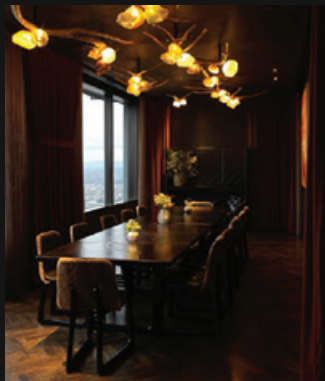
Vue de Monde Private Dining Event Jul 26 | Rialto Towers