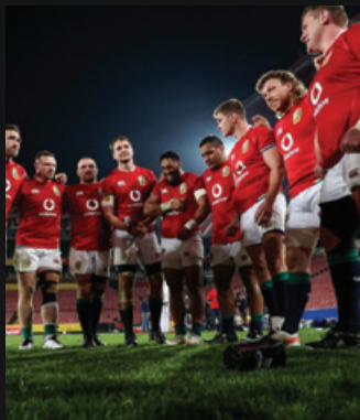
British & Irish Lions Tour Ballot Access* Jul 26 | MCG Suite