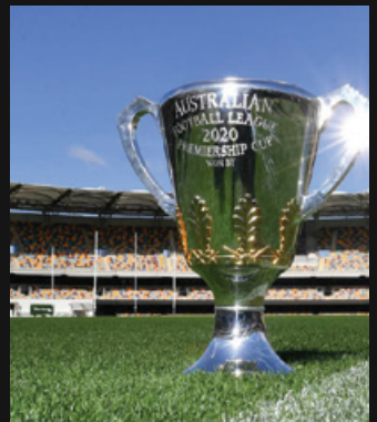
AFL Grand Final Ballot Access* MCG Suite