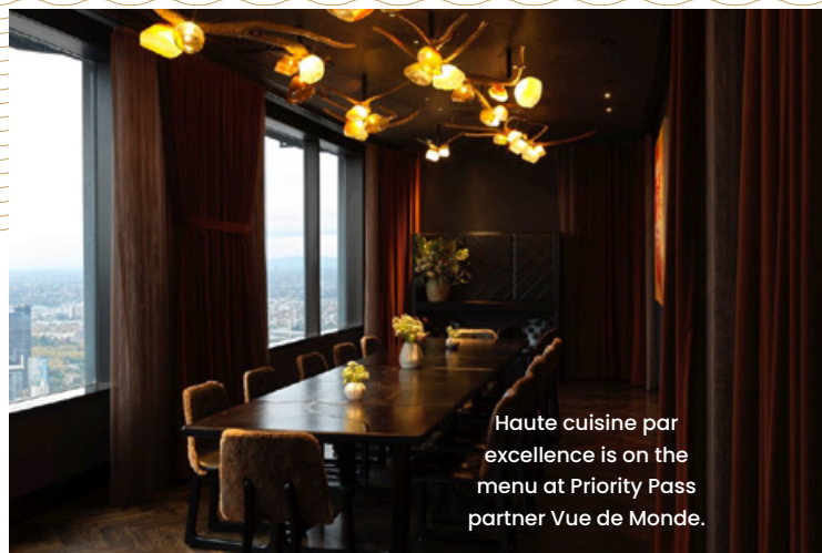
Haute cuisine par excellence is on the menu at Priority Pass partner Vue de Monde.

I magine having the key to unlock a world of exclusive experiences in sport, music, dining, and entertainment — all at your fingertips.