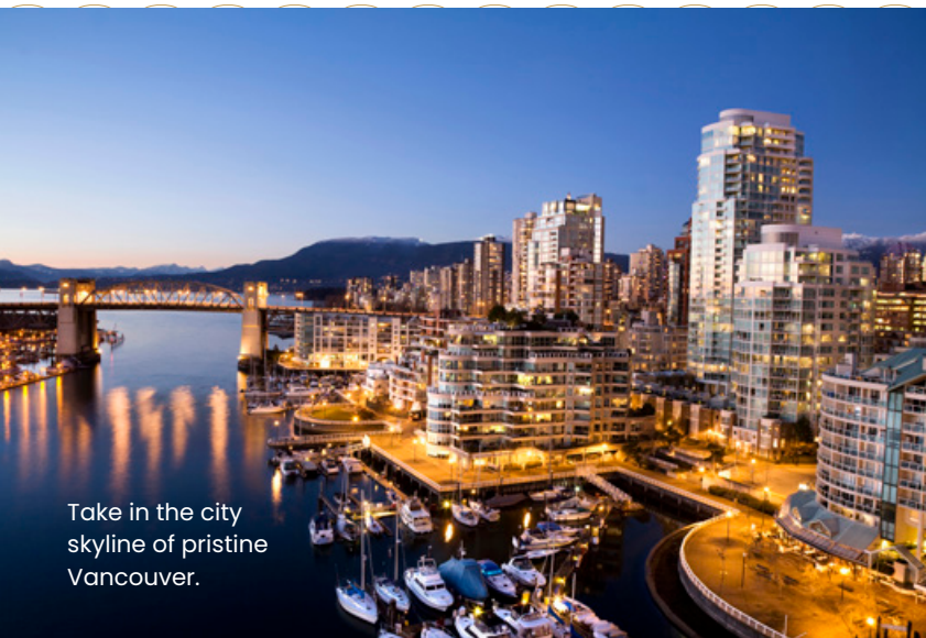
Take in the city skyline of pristine Vancouver.

N atural splendour and breathtaking vistas abound in Canada and Alaska. For must-see destinations and an unforgettable itinerary, we offer the ultimate travellers' guide.