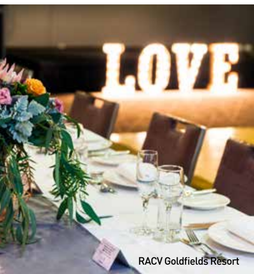
RACV Goldfields Resort