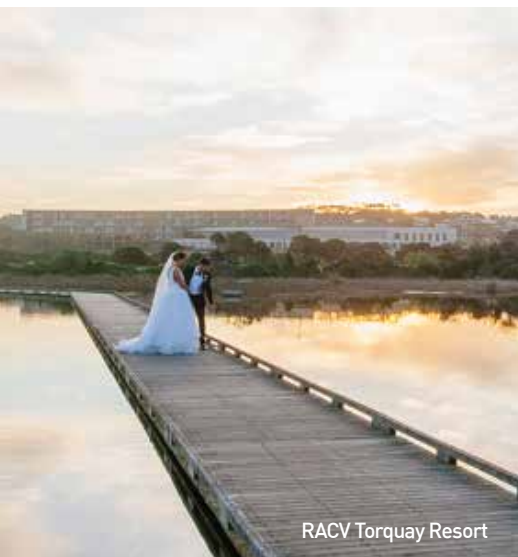
RACV Torquay Resort