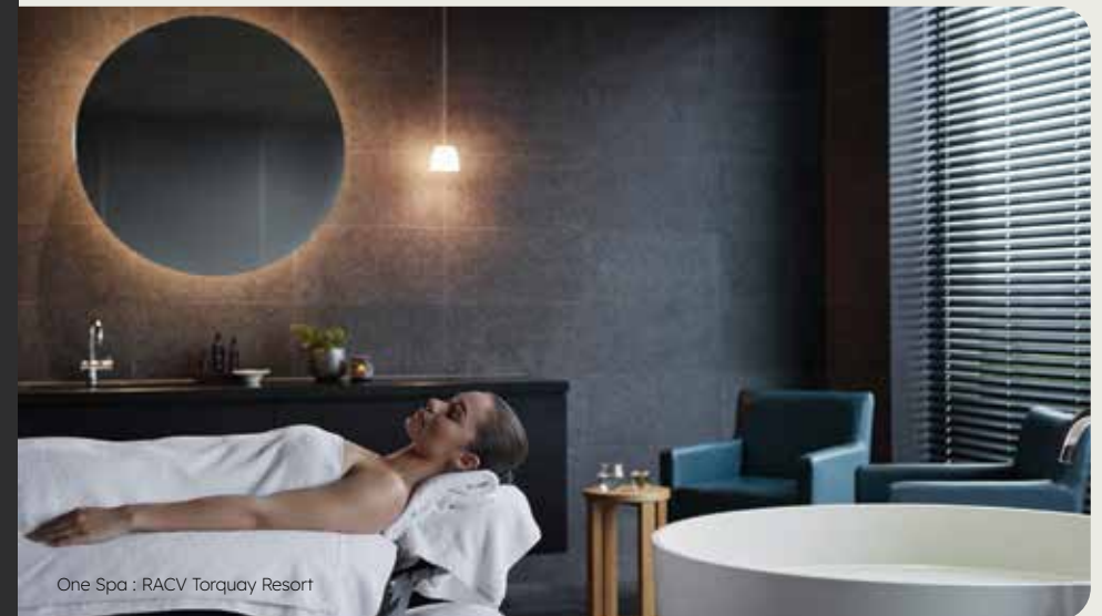
One Spa : RACV Torquay Resort

Skin is revitalised with a full body Akwaterra exfoliation before being cocooned whilst tension is eased with a scalp, neck and shoulder massage.