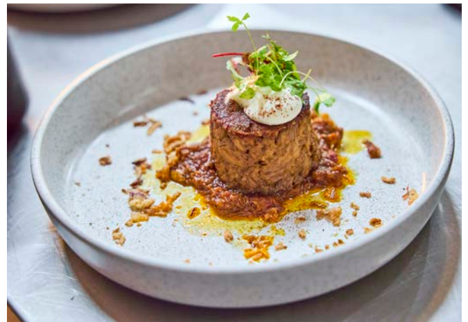
The Naugaon twice-cooked lamb was voted the best dish.

"The dish is unique: we cook it until the meat falls off the bone, shred it, and put it back together in a cylinder, which is refrigerated until it