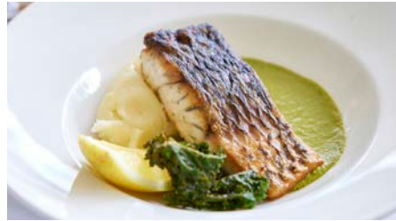
The panfried barramundi with pomme puree, coconut coriander emulsion and crispy kale was well suited to the warm autumn weather.