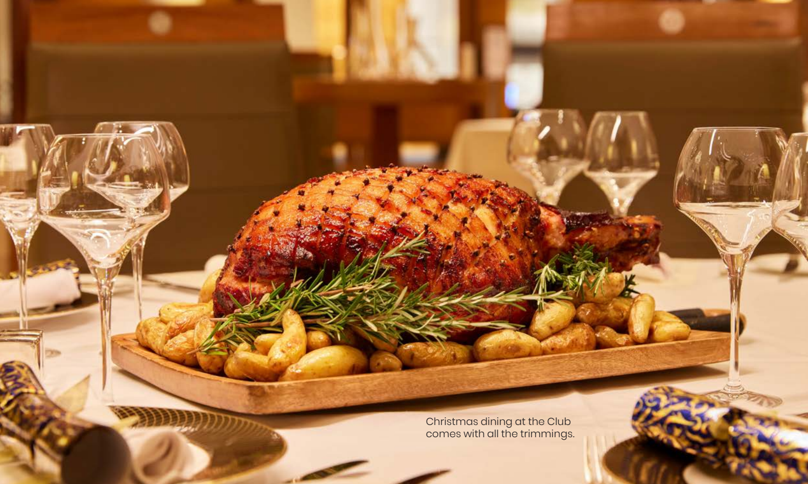
Christmas dining at the Club comes with all the trimmings.