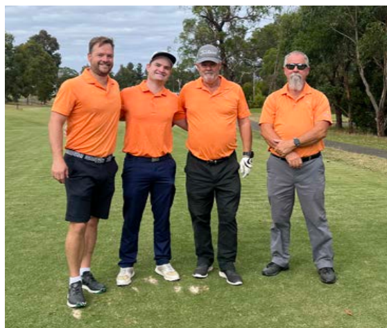
It was a friendly game, but the President's Cup was still keenly contested by members, guests and golfing enthusiasts.

● There are many benefits to holding an RACV Healesville Country Club & Resort Season Pass. Find out more, call (03) 5969 9451 or email healesville@golf.racv.com.au