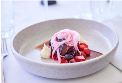
The chocolate terrine with macerated berries, double cream and Persian fairy floss topped off a fun-filled day.