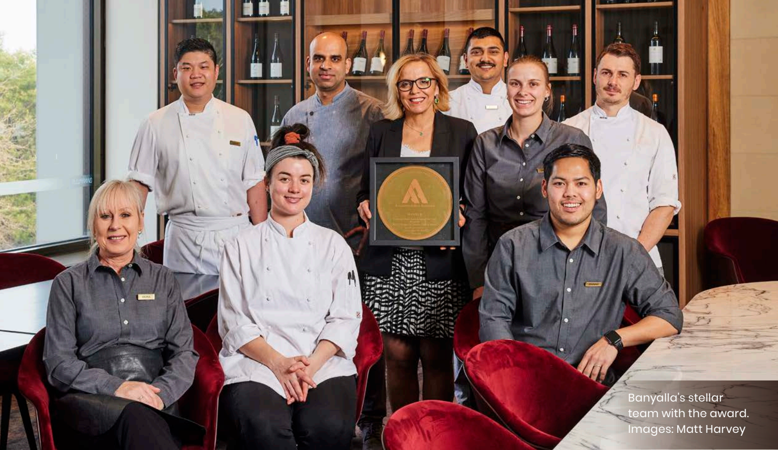
Banyalla's stellar team with the award.