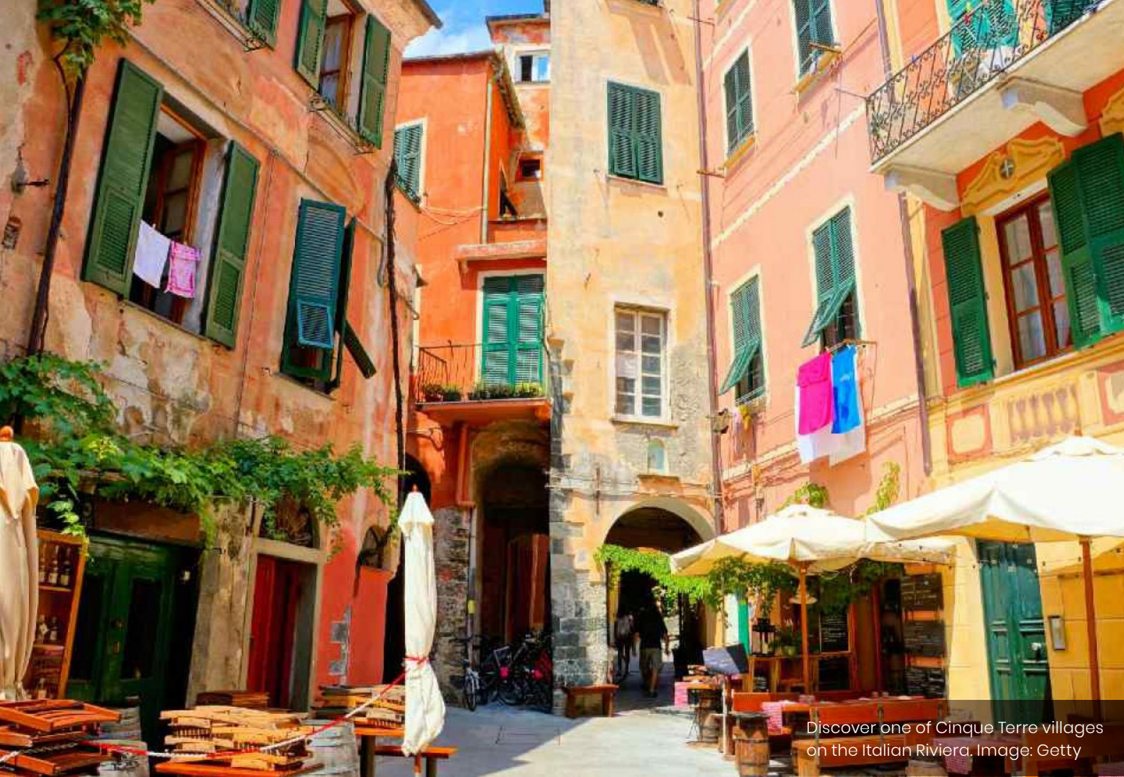
Discover one of Cinque Terre villages on the Italian Riviera.