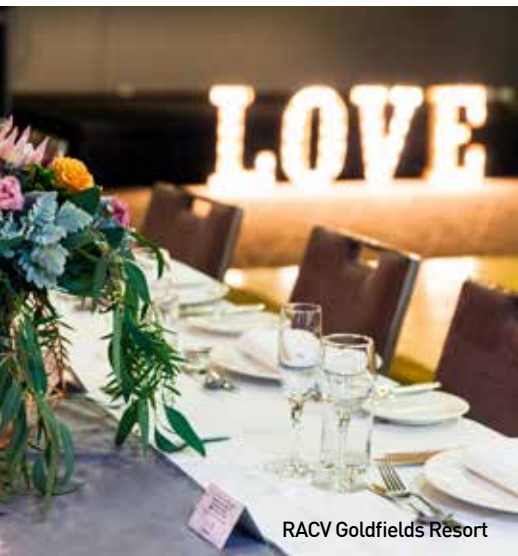
RACV Goldfields Resort