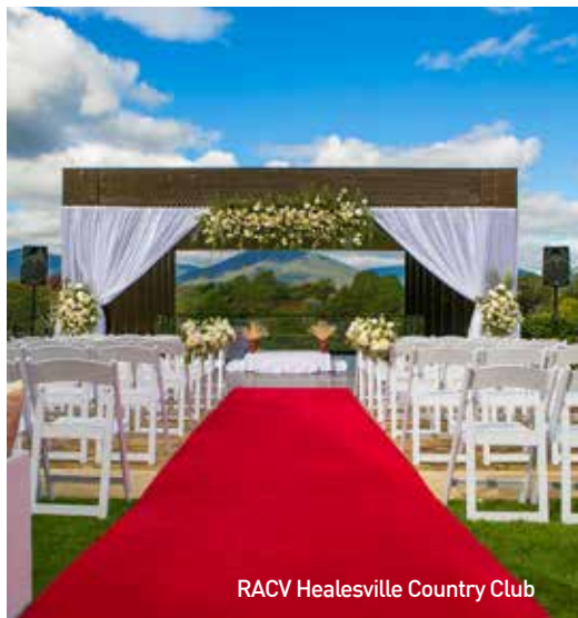
RACV Healesville Country Club