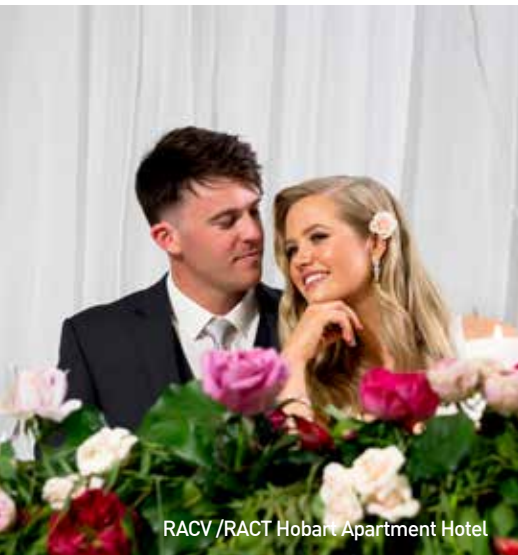
RACV / RACT Hobart Apartment Hotel