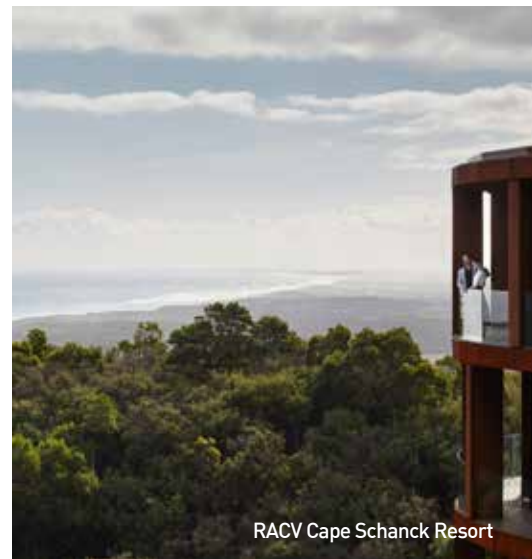
RACV Cape Schanck Resort