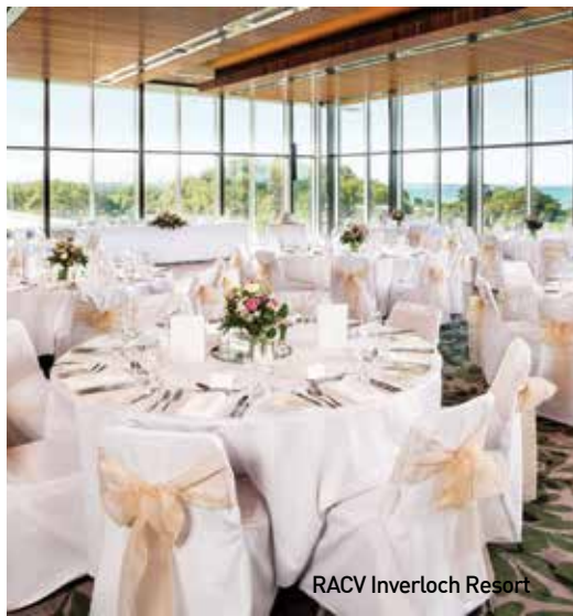
RACV Inverloch Resort