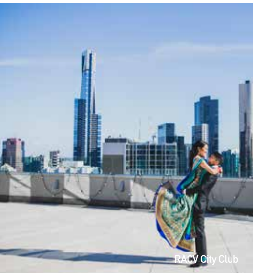
RACV City Club