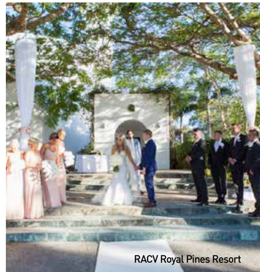
RACV Royal Pines Resort