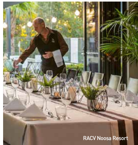
RACV Noosa Resort